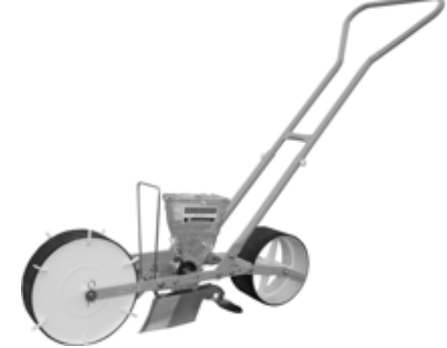
MODEL 90 DELUX MULCH LAYER